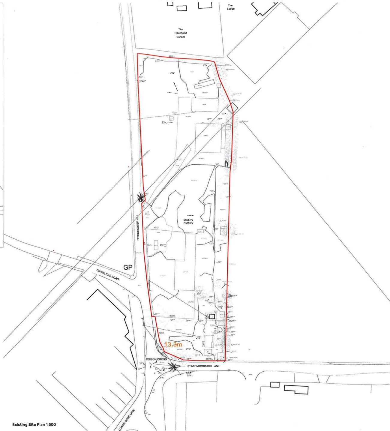
Existing Site Plan 1:500